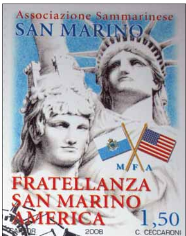
A San Marino postage stamp commemorating the positive relationship between the Sammarinese and United States. The stamp can be purchased from the San Marino government Web site www.aasfn.sm .