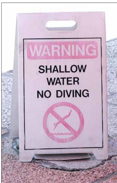
Warning signs and rules of the pools are posted in many locations. Patrons are encouraged to review the rules with their children prior to entrance.