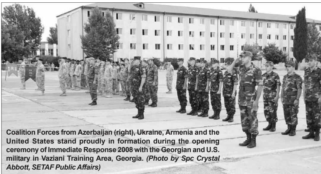
Coalition Forces from Azerbaijan (right), Ukraine, Armenia and the United States stand proudly in formation during the opening ceremony of Immediate Response 2008 with the Georgian and U.S. military in Vaziani Training Area, Georgia.

Below: Friends and family members of 173rd Airborne Brigade Combat Team begin celebrating their loved ones' return as buses carrying Soldiers pull into the Hoestra Field Saturday July 12.