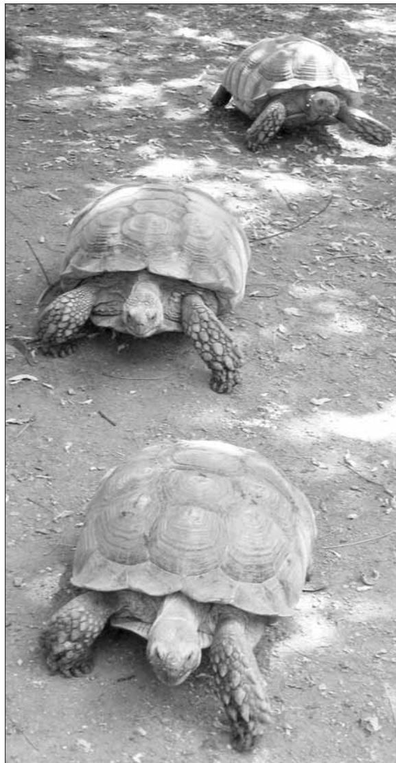
Three of the many giant turtles in their habitat. The turtles, along with other animals in the zoo, recently added new additions which were highlighted by the pink and blue ribbons around their area.

During the summer through Nov. 15, the park is open from 9 a.m. to 7 p.m. Saturday